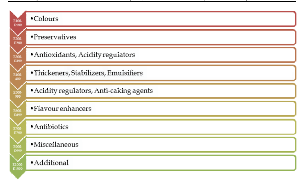
Fig. 2. Classification of additives by numeric range

In the EU, to authorize a substance as a food additive, a reasonable case of technological need, no hazard to consumers at level of proposed use and no misguidance to consumers should be demonstrated. To evaluate whether the newly released food additive has an effect on health; The European Commission is required a consultancy from Scientific Committee on Food (SCF). In this context, SCF deals with questions relating to the toxicology and hygiene in the entire food production chain for consumer health and food safety issues. For submission of a new food additive, the evaluation process by the SCF requires administrative, technical, toxicological data and references (European Commission Health & Consumer Protection Directorate, 2011). Among these, toxicological data obtained from experimental studies have a crucial role for consumers' health due to the presence of any additive in food.